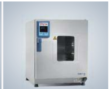
Viewing window in 100L unit