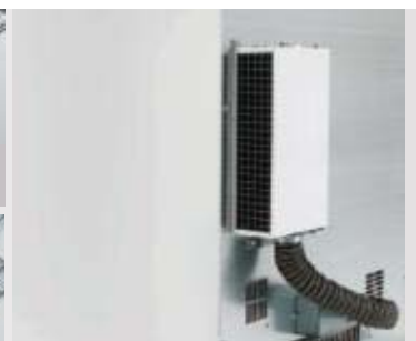
Fresh air particle Filter