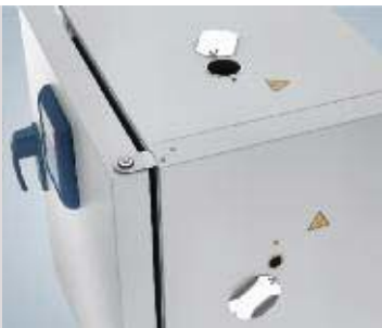
Access port top and right

Please ask for our special solutions. We can provide Heratherm tabletop ovens for cable testing applications, clean room applications, and inner casing with conditional gas-tightness for inert gas applications. We can provide additional access ports for the large capacity ovens at your preferred position, on demand.