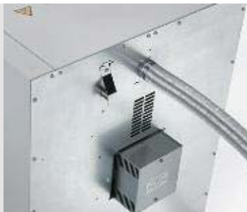
Underbench installation kit