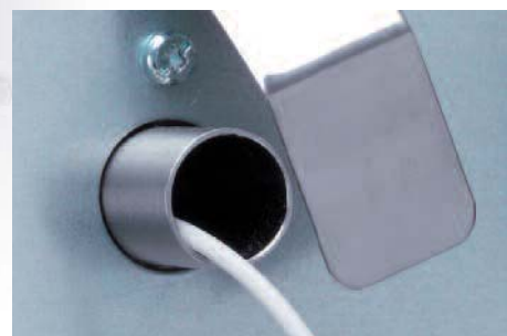
Dedicated access port (18 mm in diameter) allows the introduction of independent sensors