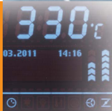
Operating temperatures as high as 330 °C