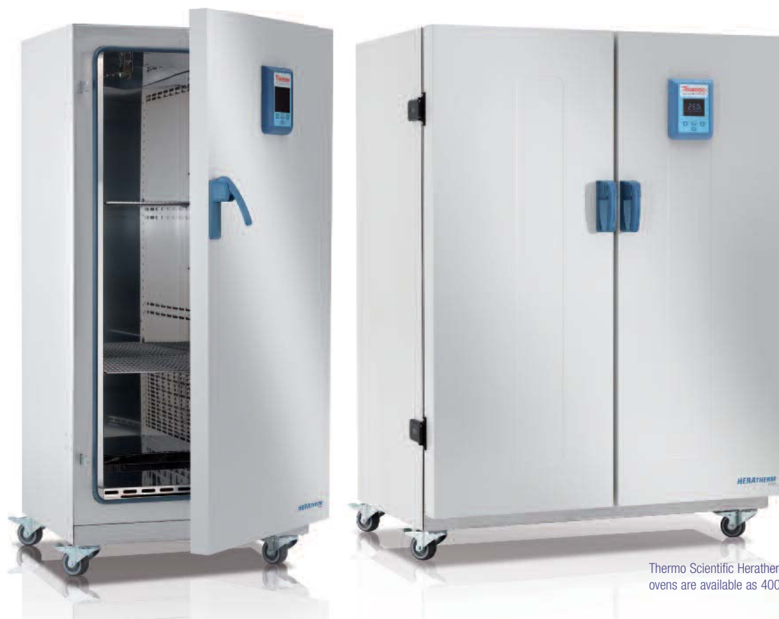
Thermo Scientific Heratherm large capacity ovens are available as 400 L and 750 L units

Heratherm large capacity ovens have been designed with your need for larger samples or high sample volume in mind. The General Protocol ovens provide high capacity for your day-to-day drying and heating applications.