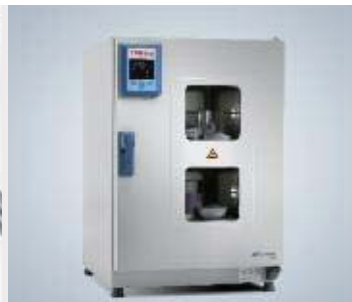
Viewing windows in 180L unit